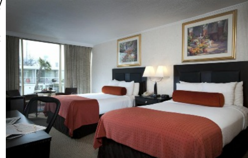
Two Doubles Room at el Tropicano Riverwalk Hotel