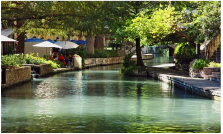
Take a Boat Tour or Stroll along San Antonio's River Walk

San Antonio is where you're most likely to see that friend of a halfcentury ago.